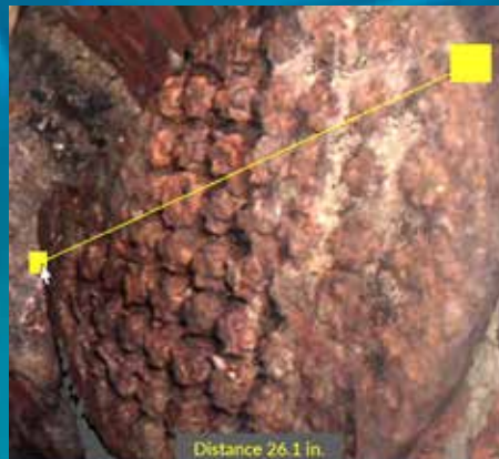
Measurable Color Point Cloud