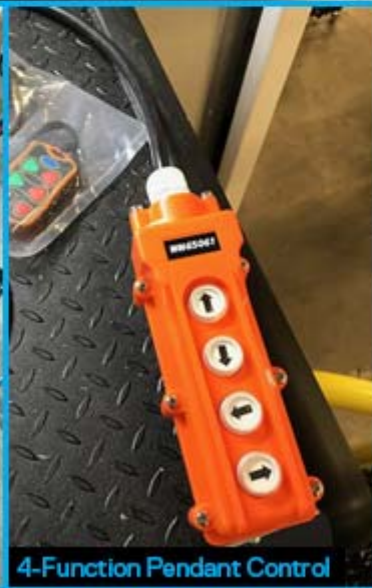
4-Function Pendant Control